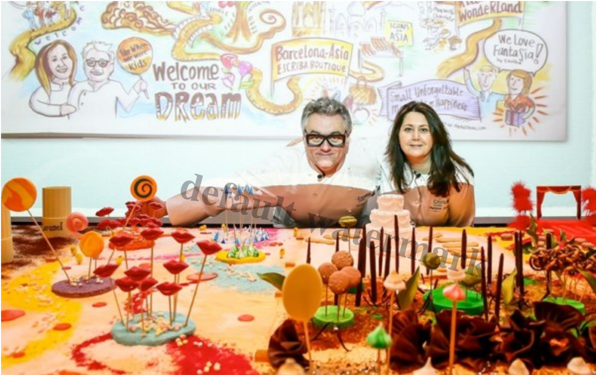
Fantasia By EscribÃ

Move over Willy Wonka. A life-size extravaganza to rival Charlieâ€™s beloved Chocolate Factory is bound for Singapore. Sweet lovers will be in seventh heaven when they visit this confectionery wonderland on 22 â€“ 24 August at the Marina Bay Sands Convention Centre.