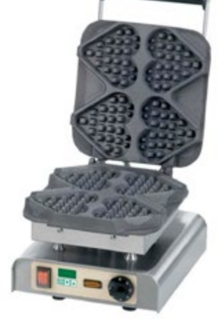
Heart Waffle On a Stick Uncoated Cast Iron Plates