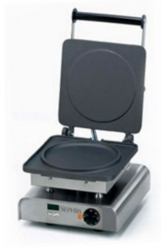
Sephra Pancake Maker Uncoated Cast Iron Plates