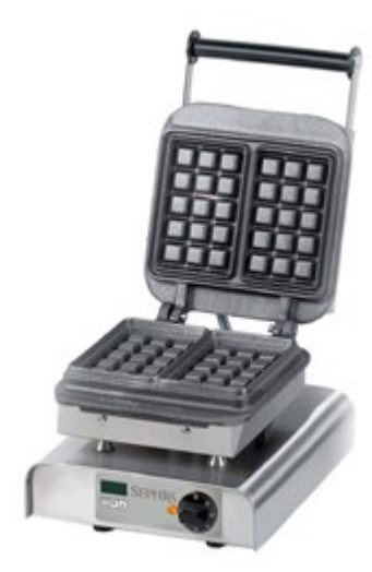
Brussels Waffle Maker Uncoated Cast Iron Plates