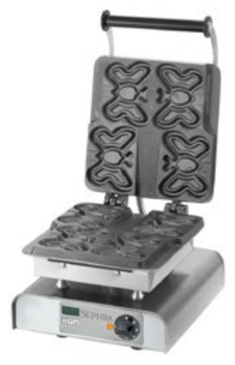
Butterfly Waffle On a Stick Uncoated Cast Iron Plates