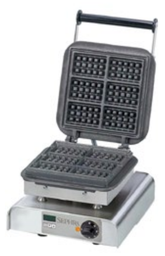
Square Lolly Waffle On a Stick Uncoated Cast Iron Plates