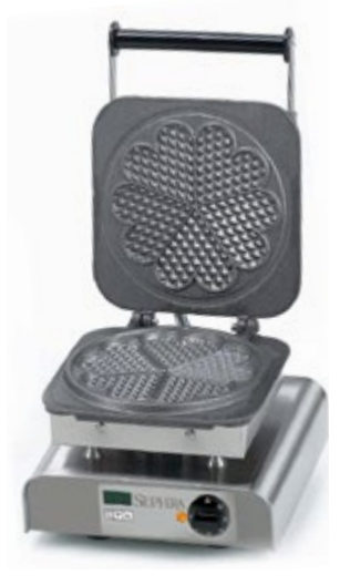
Big Heart Waffle Maker Uncoated Cast Iron Plates