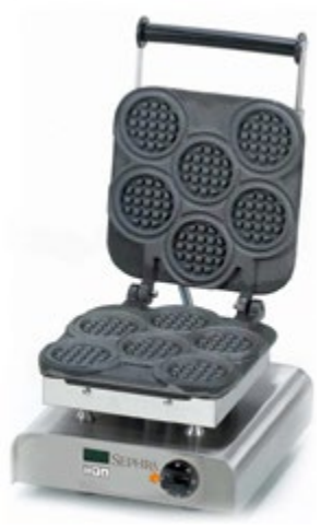
Greek Waffle Maker Uncoated Cast Iron Plates