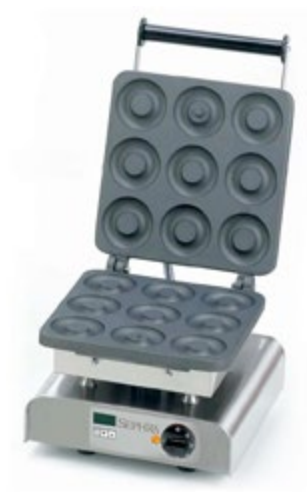
Sephra Donut Waffle Maker Coated Aluminium plates