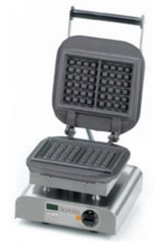
Sephra Lorraine Waffle Maker Uncoated Cast Iron Plates