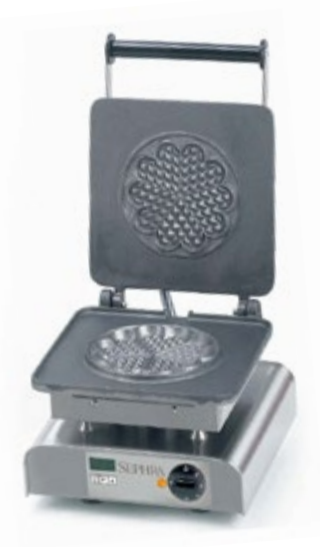
Small Heart Waffle Maker Coated Aluminium Plates