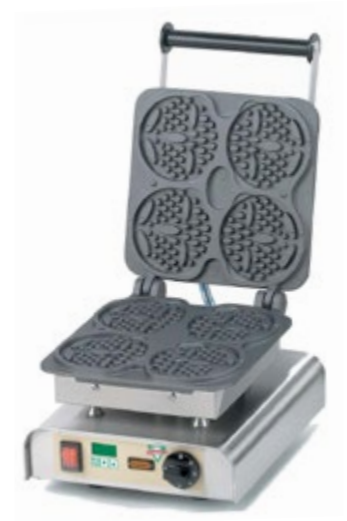
Bear Waffle On a Stick Coated Aluminium Plates