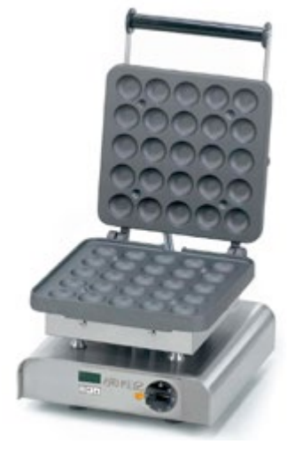
Sephra Waffle Ball Maker Coated Aluminium Plates